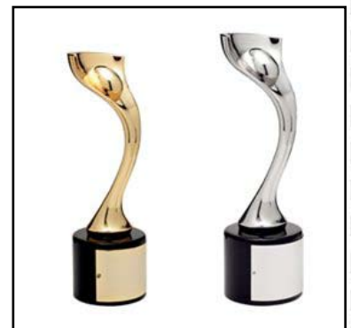
Teens in the Driver Seat won two Davey Awards for the 2009 TDS Television Campaign

Congratulations and thank you to everyone who was involved in the production of the 2009 PSAs.