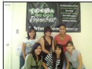
Valle Verde High School TDS group works to promote safe driving messages throughout the school year.