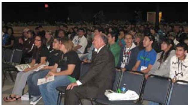
Crowd at the Summit during the key note.