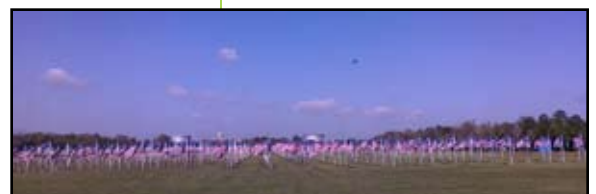
Healing Fields Memorial placed 1,616 American flags to represent Texans who lost their lives to drunk driving crashes last year.