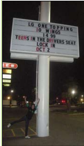
Peter Piper Pizza sponsored a TDS lock-in for local middle schools in the Laredo area to learn more about TDS from Vidal M. Trevino High School students.

finished pre-assessments and set up information booths at football games where they handed out promotional items. In addition, the student team posts TDS fact sheets in the bathroom stalls weekly.