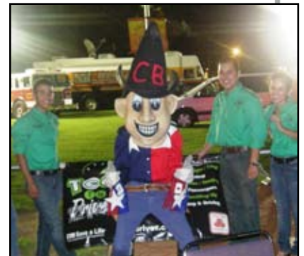
Vidal M. Trevino High School TDS team participated in the second annual National Night Out and showed their support for safe teen driving.