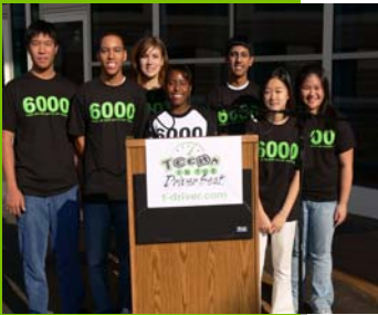
Duluth High School students hosting press conference

DULUTH, Georgia – Students at Duluth High School held a press conference to highlight their school's lack of awareness on the top five teen driving risks and driving behavior. Here are just a few of the points: